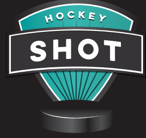
HOCKEY SHOT FUNDRAISER